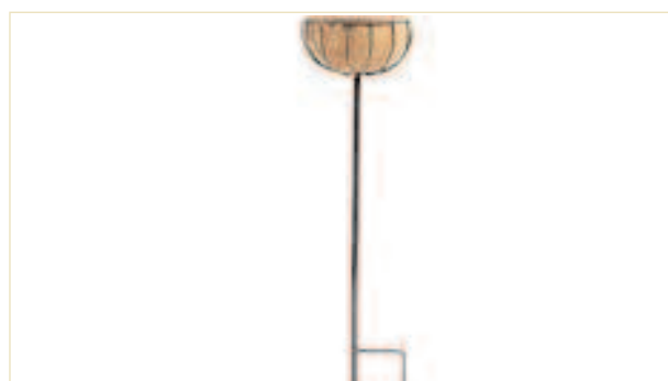
Tom Chambers Border Basket 14in £19.99