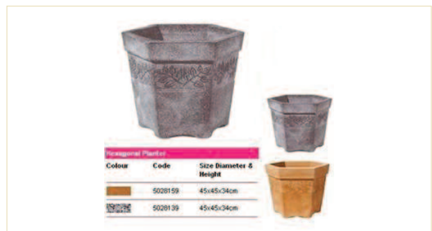
Stewarts Sylvan Hex Pot 45cmr £17.99