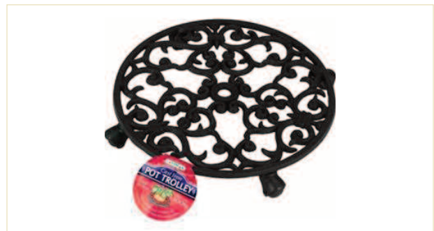
Gardman Cast Iron Pot Plant Trolley 31cm (12in) Black £13.99