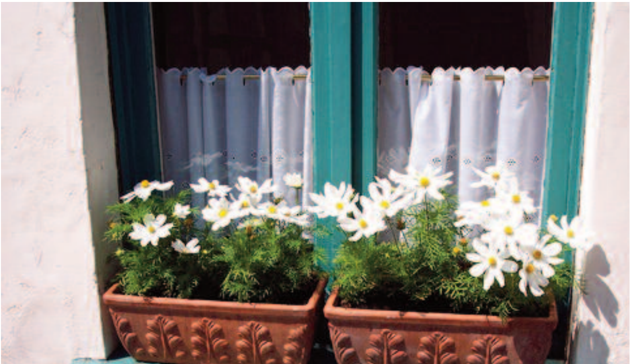
The right window box gives guests a warm welcome

A beautiful and bountiful window planter is a warm greeting to guests approaching your home or business. It can add a decorative touch to any space, whether you live in a flat or a house.