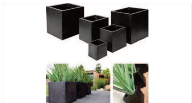
Cadix Black Pot Square Planter From £12.99