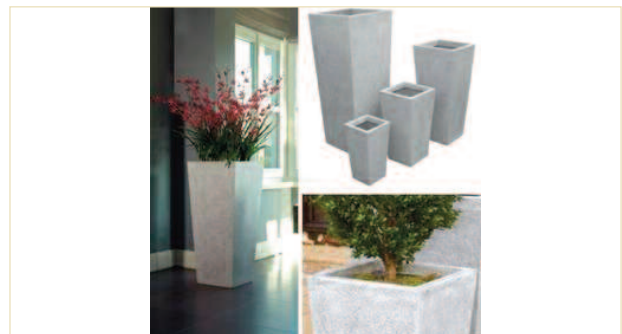
Cadix Grey Tapered Square Planter From £23.99