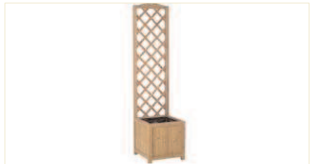
Gardman Trellis Wooden Patio Planter £39