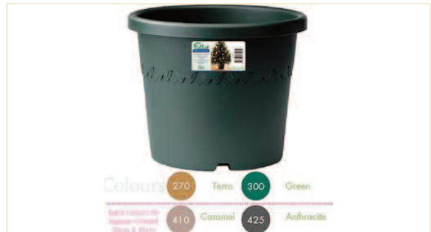
Elho Algarve Cilindro Plastic Planter From £3.49