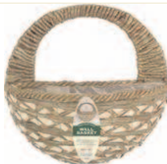
Gardman 40cm (16in) Woven Banana Grass Wall Basket £7.49