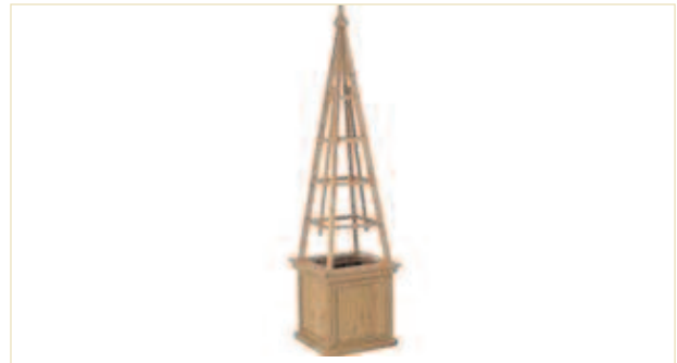
Gardman Obelisk Wooden Patio Planter £39

www.Dobbies.com/planters www.Dobbies.com/advice www.Dobbies.co.uk/blog