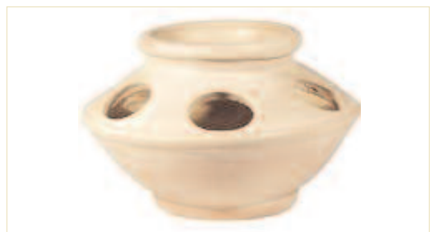
Terracotta Herb Planter £14.99