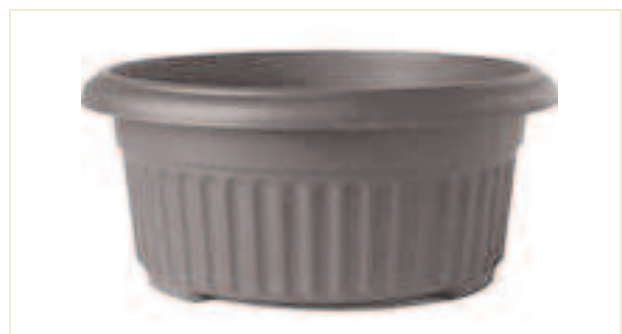
Stewarts Corinthian Low Planter Plastic Pot 45cm Black £4.99