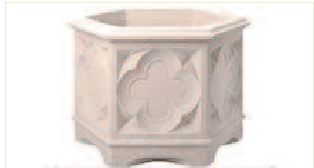
Stewarts Gothic Hexagonal Plastic Planter White Stone 39cm £14.99