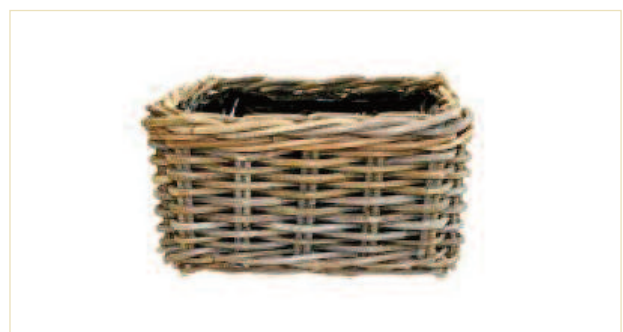
Verandhi Grey Basket 30x30x15 £13.99