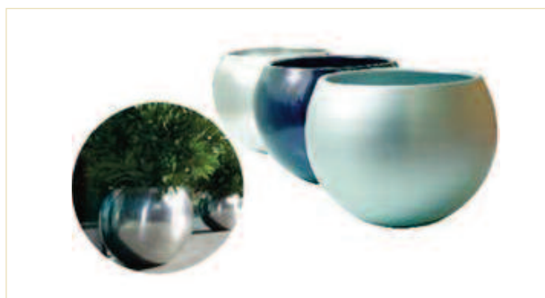
Cadix Mirror Ball Planter £45