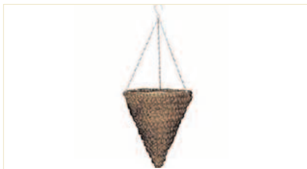
Gardman 30cm Hyacinth Hanging Cone Basket £8.49