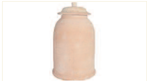
Rhubarb Forcer £39