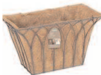
Gardman Gothic 50cm (20 inch) Wall Trough £11.99

Wall planters are your chance to highlight and showcase your growing skills and they can beautify your home - both indoors and out.