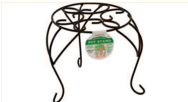
Gardman Tall Pot Stand 25cm (10in) Round Black £6.49