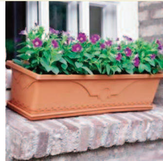
Elho Algarve Trough 50cm Terra £5.99

If you're looking for a traditional and aesthetic choice, consider a terracotta planter. Synthetic and plastic planters are also available, popular for their durability.