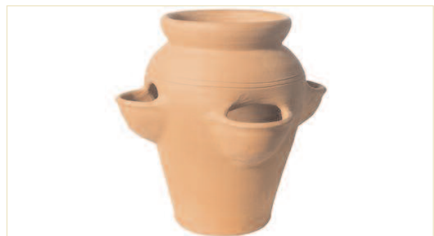
Terracotta Strawberry Planter 35cm £19.99