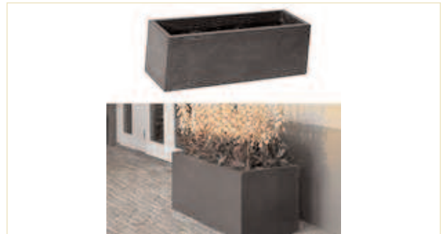
Cadix Lightweight Black Balcony Terrazzo Planter £35.99

Alternatively, plant movers and trolleys are available to help you shift your pots around. These are relatively inexpensive and can help you in your quest to find the perfect spot for your plants.