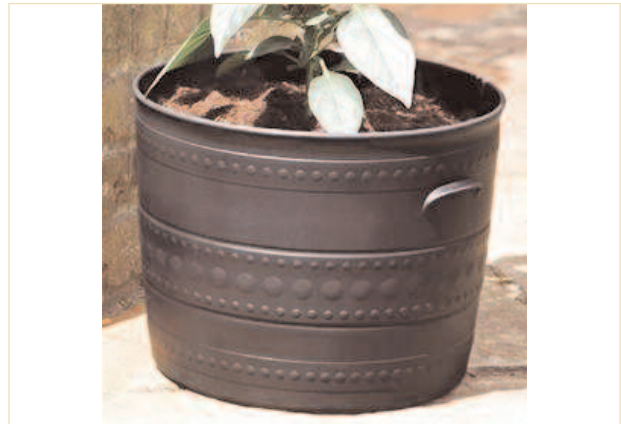
Stewarts Smithy Patio Tub Gunmetal 35cm £6.99