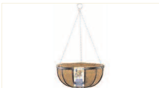
Gardman Georgian Hanging Basket From £6.99

Hanging planters can set the tone of a garden for years to come. So, whether you opt for a single hanging planter or a garden full of them, your ingenuity will make your garden uniquely yours.