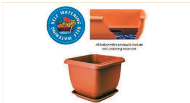
Stewarts Balconniere Self Watering 35cm Plastic Square Planter Terracotta £6.99