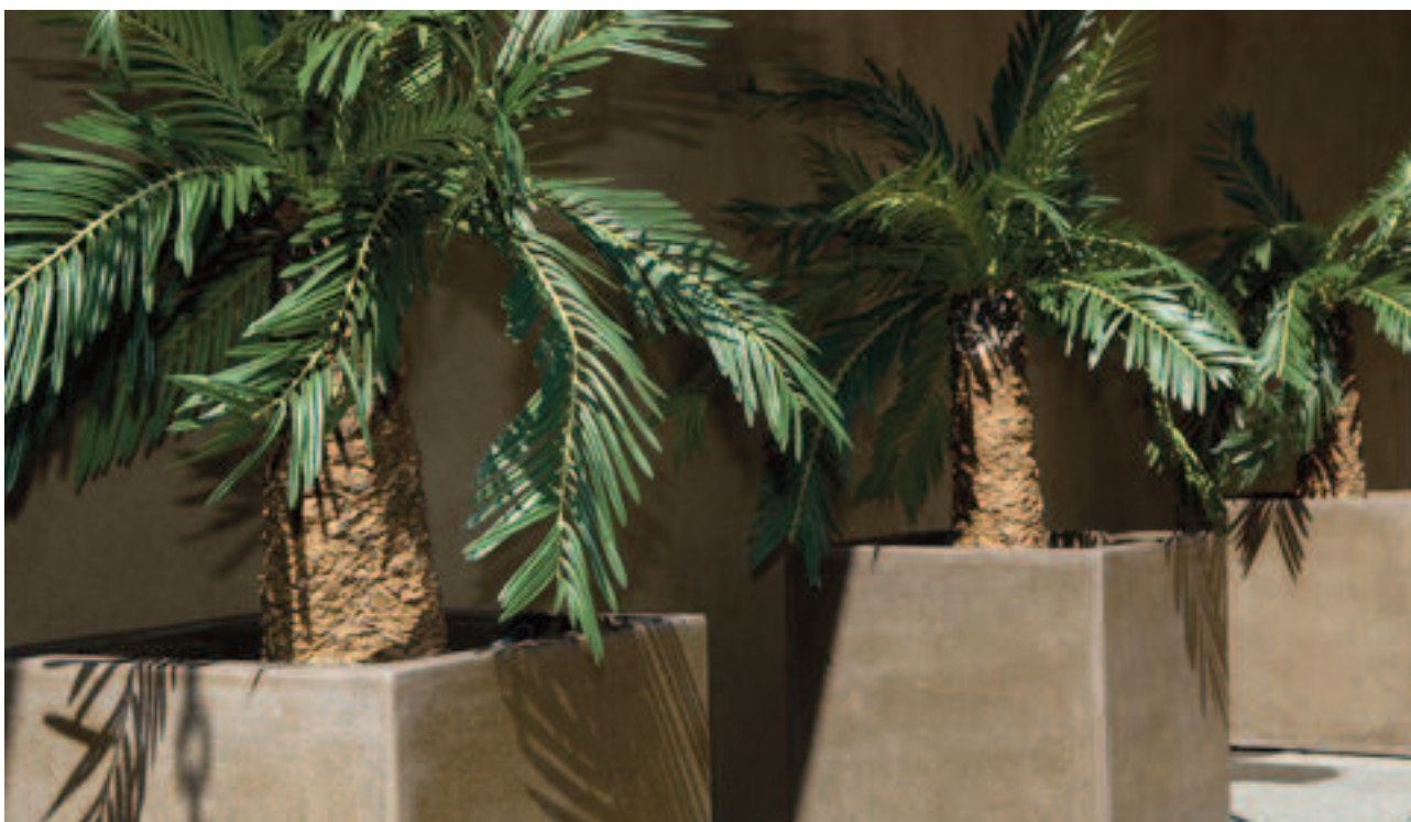
Terrazzo planters offer a smooth style with practical sturdiness

Terrazzo is made from a mixture of cement, granite and marble, which is then sanded to a smooth finish. Planters made from this material offer supreme sturdiness and a stylish, contemporary look.