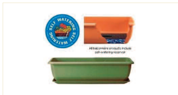
Stewarts Balconniere Self Watering 70cm Plastic Trough Dark Green £7.99