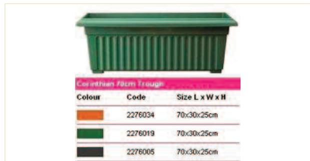
Stewarts Corinthian Trough 70cm From £5.99