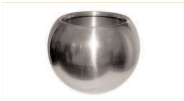
Cadix Steel Ball Planter From £45

www.Dobbies.com/planters www.Dobbies.com/advice www.Dobbies.co.uk/blog