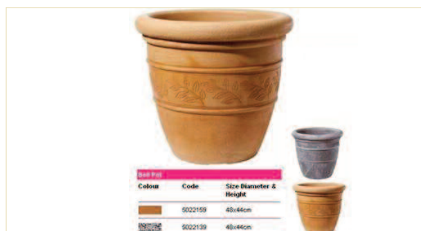
Stewarts Sylvan Bell Pot 48cm £17.99

Though flowers are the most important aspect of your garden, the garden planter itself does not go unnoticed, so pick something that is in harmony with the overall feel and atmosphere of your outdoor space.